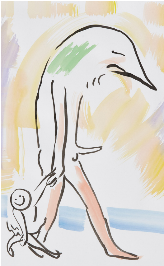
Born, Never Asked. Installation view, 2018. Metro Pictures, New York.