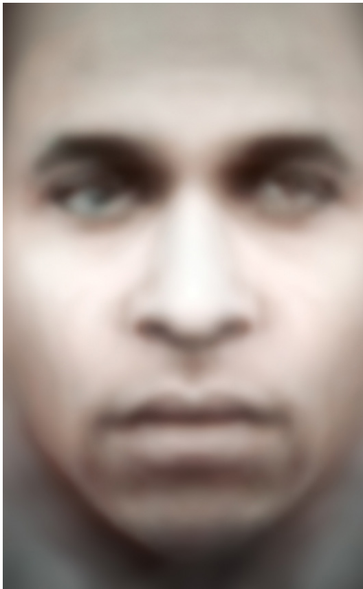
A Study of Invisible Images. Installation view, 2017. Metro Pictures, New York.