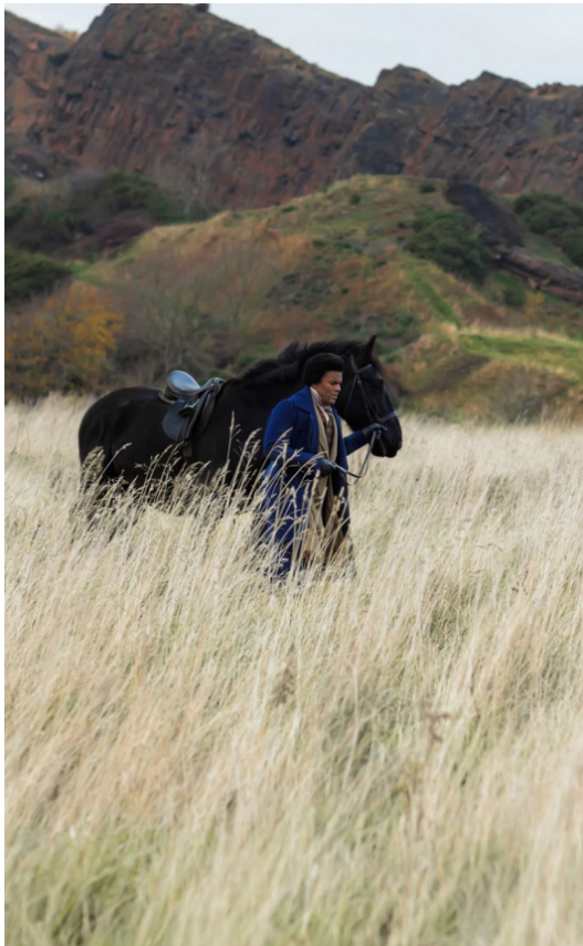
Isaac Julien, Lessons of the Hour-Frederick Douglass. Installation view, 2019. Metro Pictures, New York.