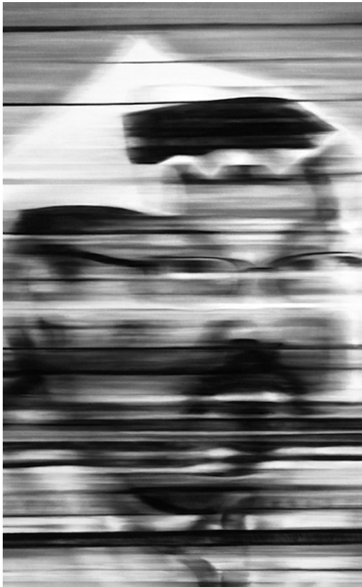
Robert Longo, Untitled (Jamal Ahmad Khashoggi; Istanbul, Turkey; October 2, 2018) (2019) (detail).